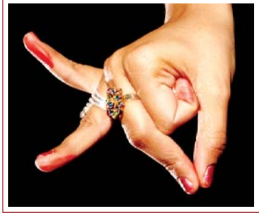
'Bhramara' (to show a Bee)