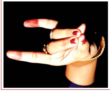
'Simha-Mukha' (to show a Deer)