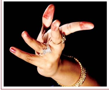
'Alapadma' (to show a Flower)